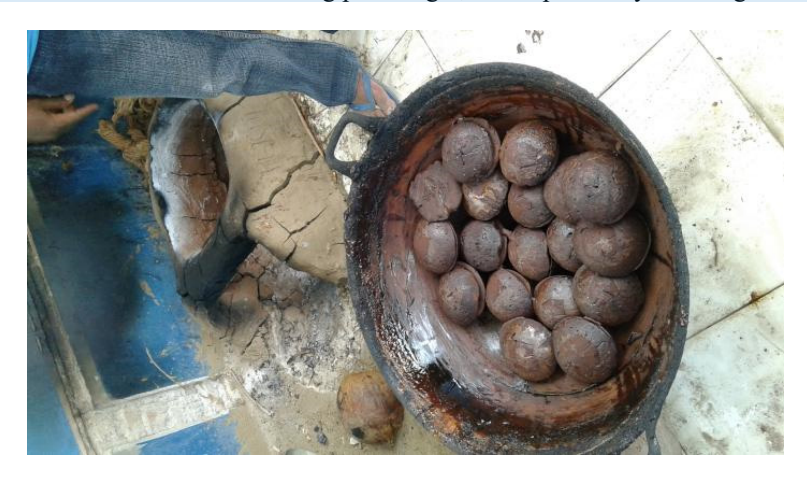
Figure 11. The freshly cooked palm sugar was cooled a few hours before it was wrapped in a kind of sago palm leaf