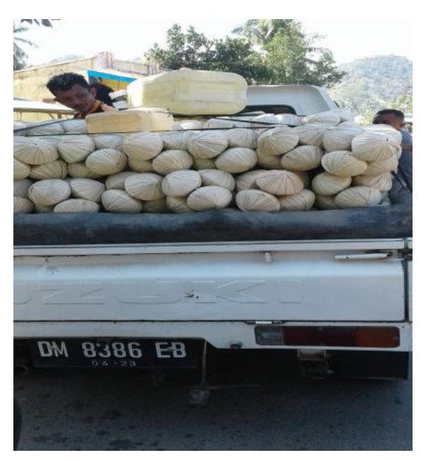
rigure 5. Middleman brought his merchandise, palm sugar, to the sub-district market

The sale of palm sugar through middlemen was actually very strangling the neck of palm sugar peasants. The price of 1 bunch of palm sugar is 20 seeds purchased by the middlemen for Rp. 80,000 to Rp. 100,000, while the middlemen sold it back to the sub-district market for Rp. 210,000,000 binders. However, peasants did not have choice to sell their artificial palm sugar to others because only the middlemen are the only buyers of palm sugar owned by farmers. In such conditions, the fate of palm sugar peasants does not change, remains in a state of poverty and helplessness.