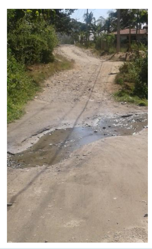
2 igure 2. The rocky steep road on the forest edge of Figure 3. The river divides the highway at the forest edge BNWNP