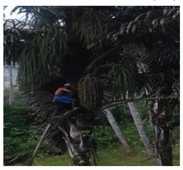
Figure 8. Palm sugar peasant was cleaning the flower arm of the palm tree

The process of producing palm sugar uses family labor. The family labor involved in this process is husband and wife. The husband first looks for the female flower of palm tree that is ready to be processed. After finding and making sure the flower is ready to be processed, the husband starts cleaning and goes through a process of several weeks until the female flower is ready to be cut and the sap water can be produced. When the sap is produced, usually husband and wife together two times a day go to the garden to take palm sugar. The husband climbes the tree to pick up the bamboo which is filled with nira water, while the wife waits under the tree to pick up the bamboo.