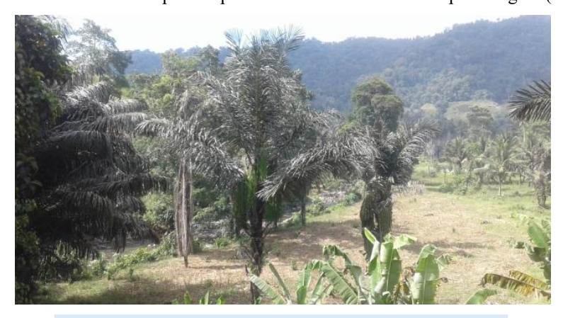
Figure 6. Palm trees grow naturally in the peasants' gardens

"Every palm sugar peasant here has a lot of palm trees. The palm trees grow itself in the garden without having to plant it. We have never planted palm trees here, but there are so many palm trees available for us to treat them into palm sap and then we cook them into palm sugar" (Gani, 2018).