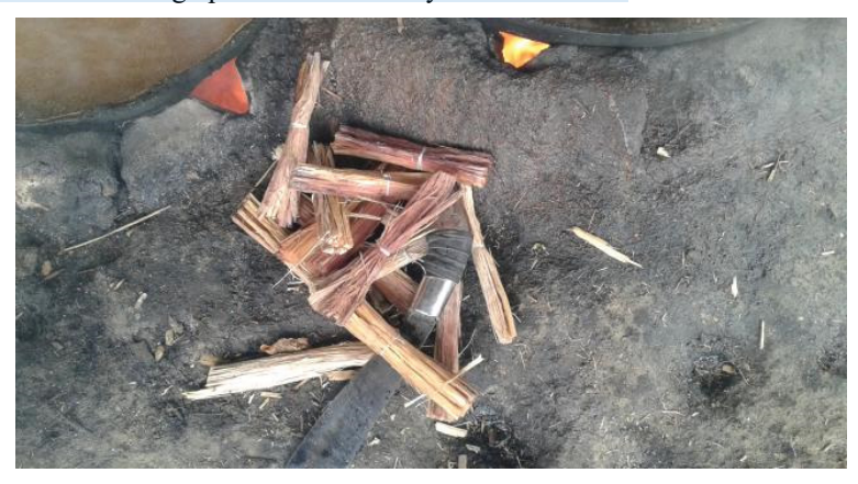
Figure 9. Boyuhu wood roots, a mixture of palm sap in the bamboo

The mixture of palm sap to produce good quality is the roots of Boyuhu wood (local wood). This Boyuhu wood roots is mixed into palm sugar when accommodates palm sap in bamboo. After arriving at home palm sugar is cooked for approximately 6 hours to produce palm sugar. The freshly cooked palm sugar is cooled a few hours before it is wrapped in a kind of sago palm leaf and ready to be marketed.