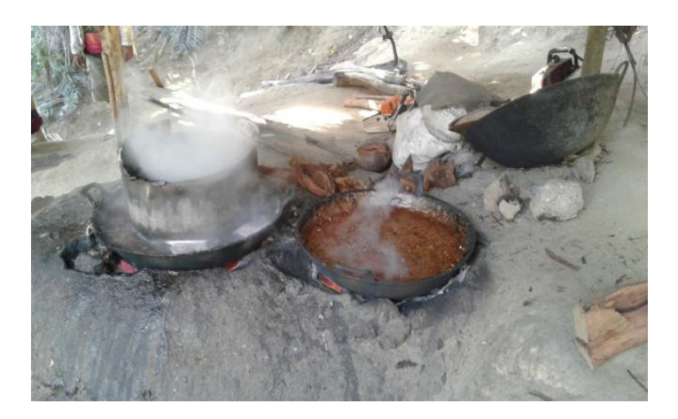
Figure 4. Cooking palm sugar traditionally

Uneven government assistance was also the problem faced by peasants. The regional government of Bone Bolango Regency, Gorontalo Province, once provided assistance with the production of palm sugar, in the form of a house for producing palm sugar and cauldron to cook palm sugar. The problem was that not all palm sugar peasants get the assistance. As a result, mutual suspicion in the peasant community cannot be avoided. Residents who did not receive assistance accused the local government of being so favoritistic that only certain groups received assistance. In addition, disputes among fellow citizens who got assistance with those who didn't get assistance also occur, in the form of mutual suspicion, self-determination, and others.