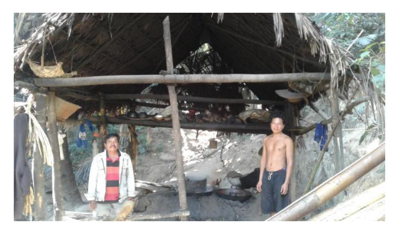
Figure 13. The hut where palm sugar is produced

So far, palm sugar peasants have used their huts to produce palm sugar. Residents hope to get help of building houses for palm sugar as well as assistance ever given to other palm sugar peasants. The current conditions when the rainy season arrives, peasants have difficulty to produce palm sugar because the huts they use often leak so that it affects the flame in cooking palm sugar.