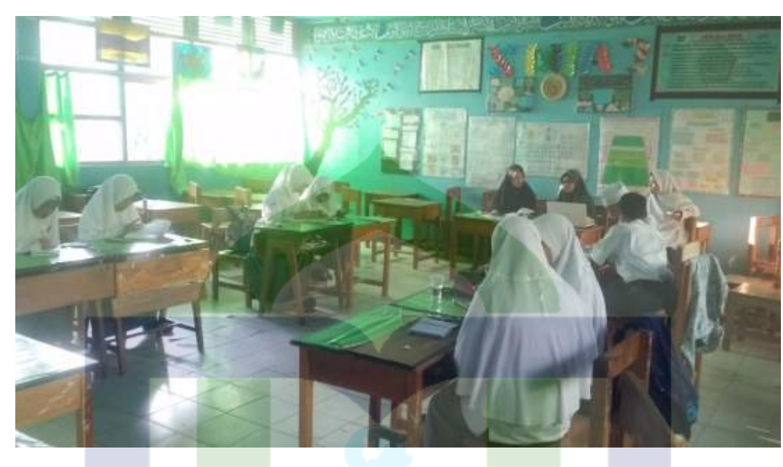
Appendix 3. The Documentation