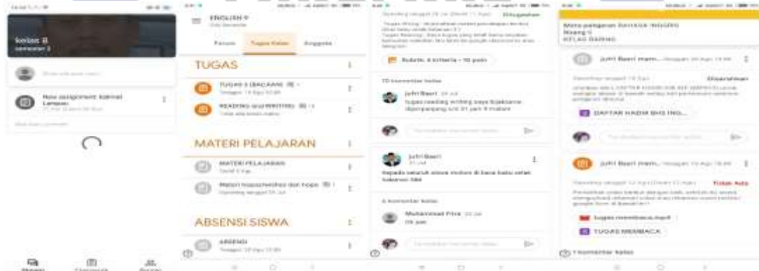
Figure 4.1.1.3(Study English using the Google Classroom application)

Before conducting an interviewed test with students and teachers, the researcher did observations to find out about the use of the Google Classroom application to the students and teacher. The researcher asked how their respond to Google Classroom application, after that the researcher provided an interview to the students and teacher. In the same time the researcher asked for documentation about the use of the Google Classroom application in learning English.