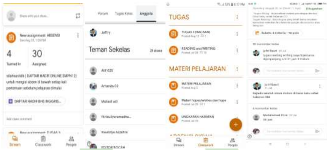
Figure 4.1.1.3(Study English using the Google Classroom application)

Other than that, teacher also used another alternative in English learning which was WhatsApp. Where WhatsApp conveyed information about the material that has been loading and complementary from the Google Classroom app. When the students do not have quotas to open the Google Classroom app, the teacher also uploaded it on WhatsApp as an antipasti for students who lack quota or mobile storage space in talking the material in Google Classroom app.