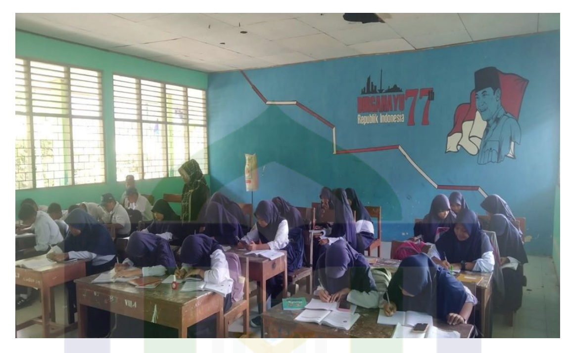
Appendix 03 : Documentation