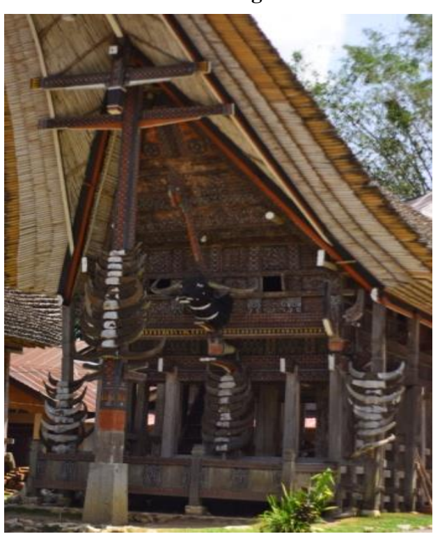
Figure 1 Picture of Tongkonan

The basic form comes from the concept of Aluk Todolo , which sees the world of order (cosmos) in three parts, namely the upper world ( ulunna langik ), the middle world ( kale banua ), and the underworld ( sulluk banua ). <sup>22</sup> The upper world ( ulunna langik ) is symbolized by the roof in the Tongkonan which is shaped like a boat. Second, the kale bola as a world meeting place between the Upper World and the Underworld. Kale Bola as a place for ' sitongkon ' is given ' sali ', which is a wooden structure that is understood as a form, the arrangement connotes harmony, mutual cooperation, and harmony. Kale Bola is a place to maintain balance, to maintain harmony in social life horizontally by maintaining a balance between orders and prohibitions ( pemali ). Third, sulluk banua , which symbolizes underworld was previously used as an area for buffalo or pig stalls.