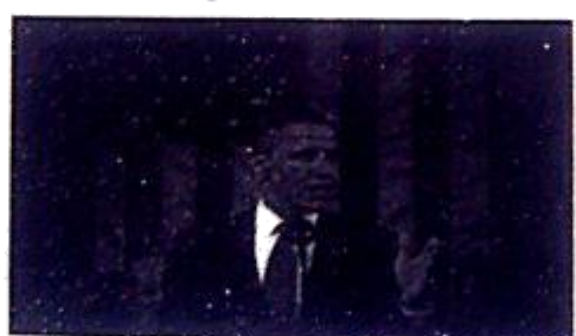
Text-2 Read the text below to answer questions 5 to 7!

Barrack Obama is the President of United States. He is an African-American. He is tall and thin. He is bald. He has dark complexion, pointed nose, and oval face.