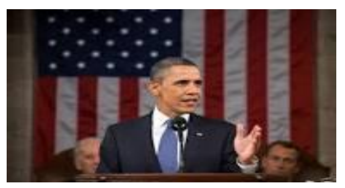
Text-2 Read the text below to answer questions 5 to 7!

Barrack Obama is the President of United States. He is an African-American. He is tall and thin. He is bald. He has dark complexion, pointed nose, and oval face.