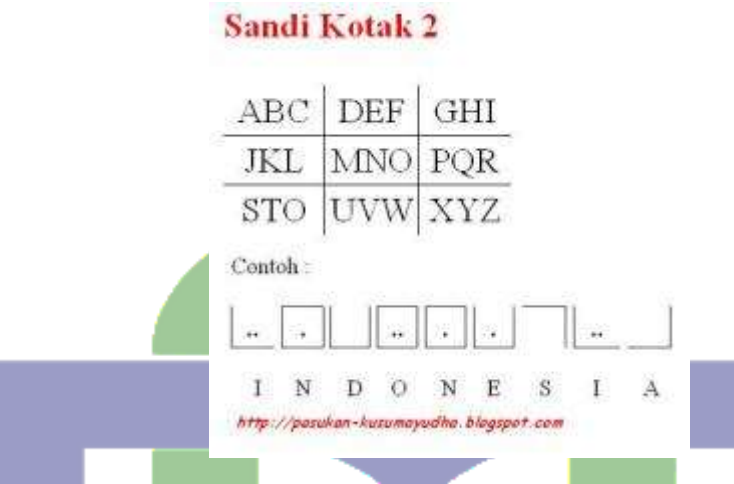
Figure 2.6 Formula Kotak 2

both code 1 and code 2 have significant differences that can be seen from the formula.<sup>14</sup>